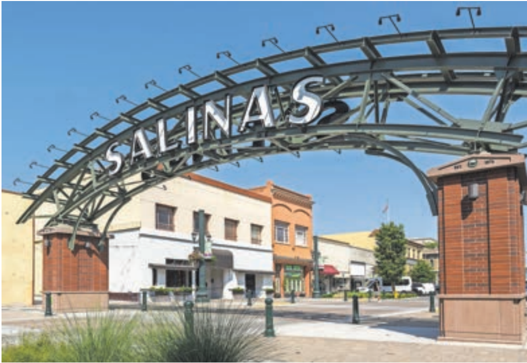
Salinas CA