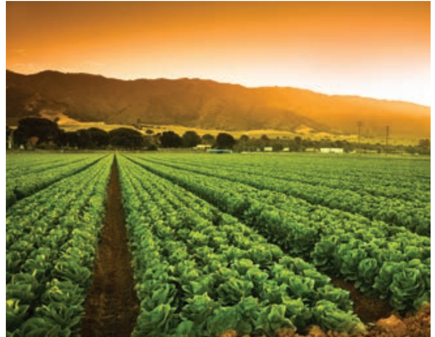
A green row of fresh crops grow on an agricultural farm field in the Salinas Valley, California.