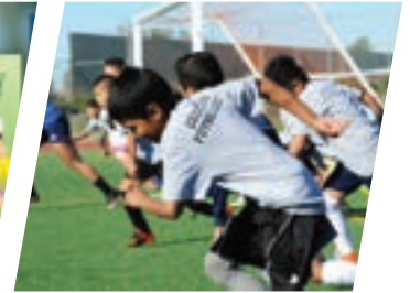
City of Salinas awards $300,000 in prevention and wellness grants page 27