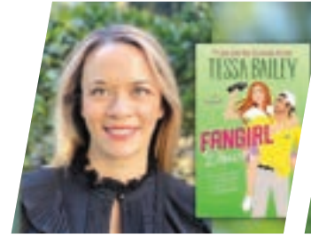
Best-selling author Tessa Bailey unveils new novel page 9