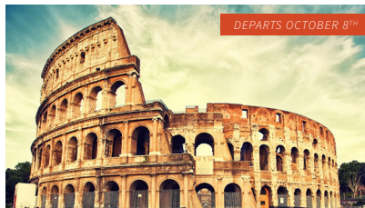
ROME PRE-TOUR 3 NIGHTS - $799

*On some dates tours and cities visited operate in a different order.