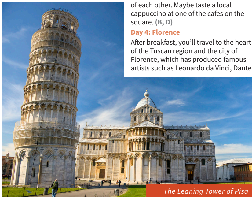
The Leaning Tower of Pisa