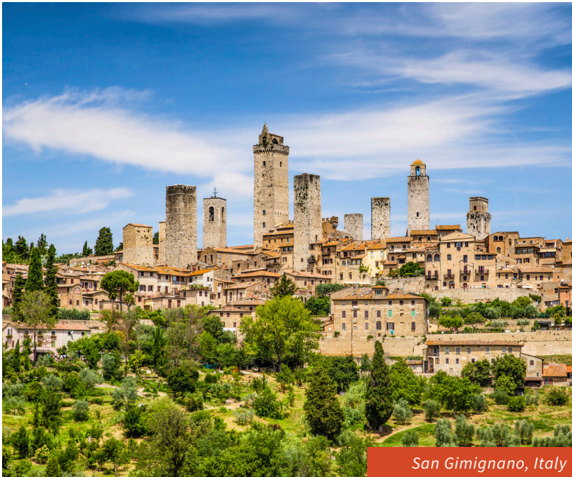
San Gimignano, Italy

wine country of Chianti this afternoon, your stop will include a winery to taste the local superb wine. Enjoy local wines and an educational program as brought to you by the leaders of the local wine industry. This evening enjoy cooking class with home-made pasta making and dinner with wine tasting. (B, D)